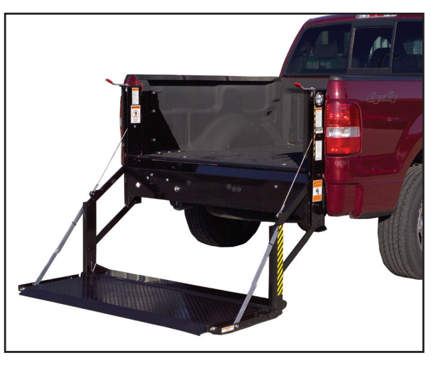
Direct Lifts for different applications